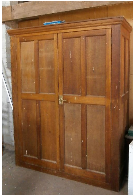
This cupboard now at Weston Hall Farm came from Lillington Stud. On the inside of the doors are listed some of the horses bred at the stud and races won by them.