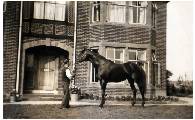
Lillington Stud Farm House