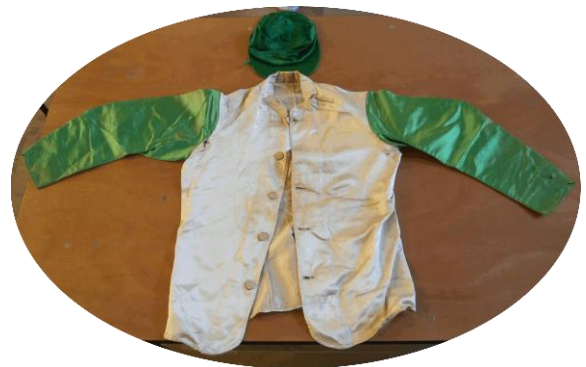
The McGregor racing colours