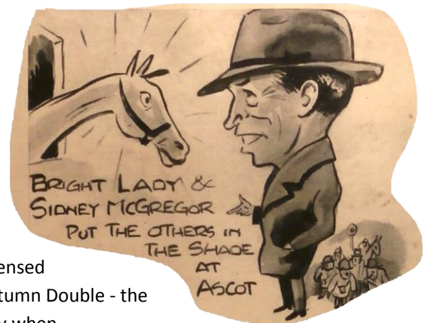
Bright Lady , daughter of April the Fifth , won the 1943 Ascot Cesarewitch